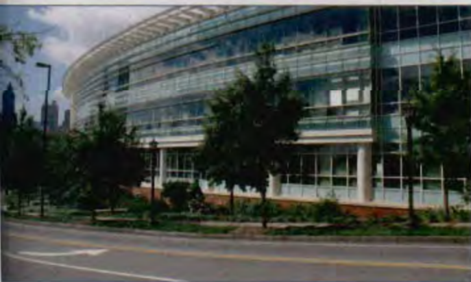
The Klaus building project team engineered a soil mix for a bioretention and landscape area that minimizes and captures runoff on a 30-ft grade change.